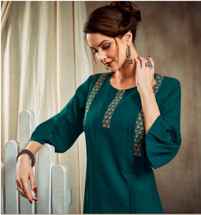
A breath taking array of fine detailing & intricate design inspired by Indian culture. 2021