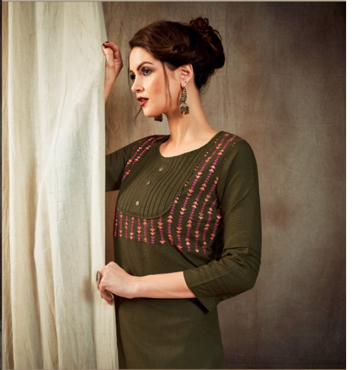
A scintillating plethora of timeless masterpieces inspired by beauty from Indian culture. 2020