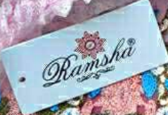
Emb Pallu Dupatta