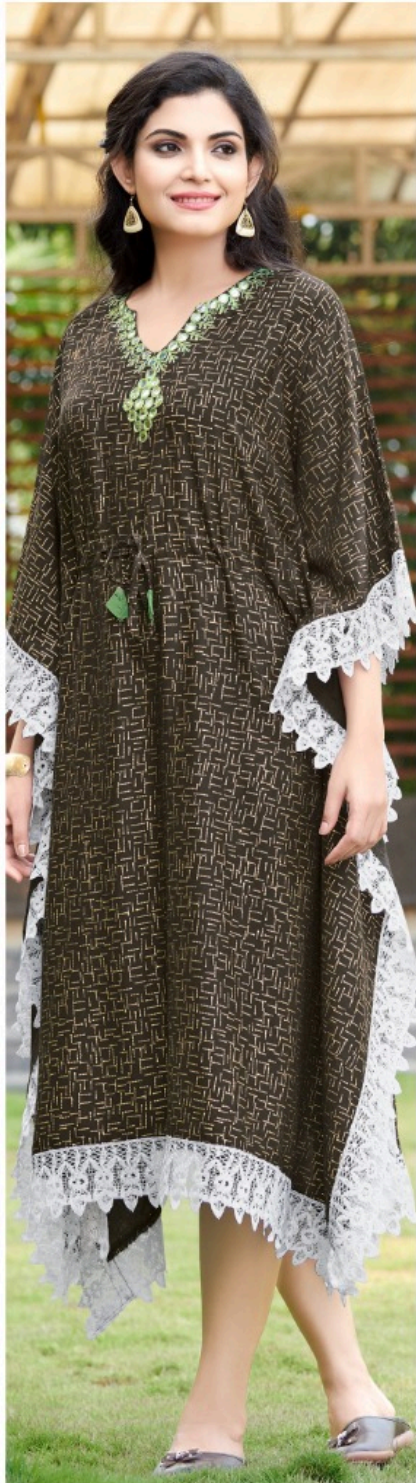
Style - 205