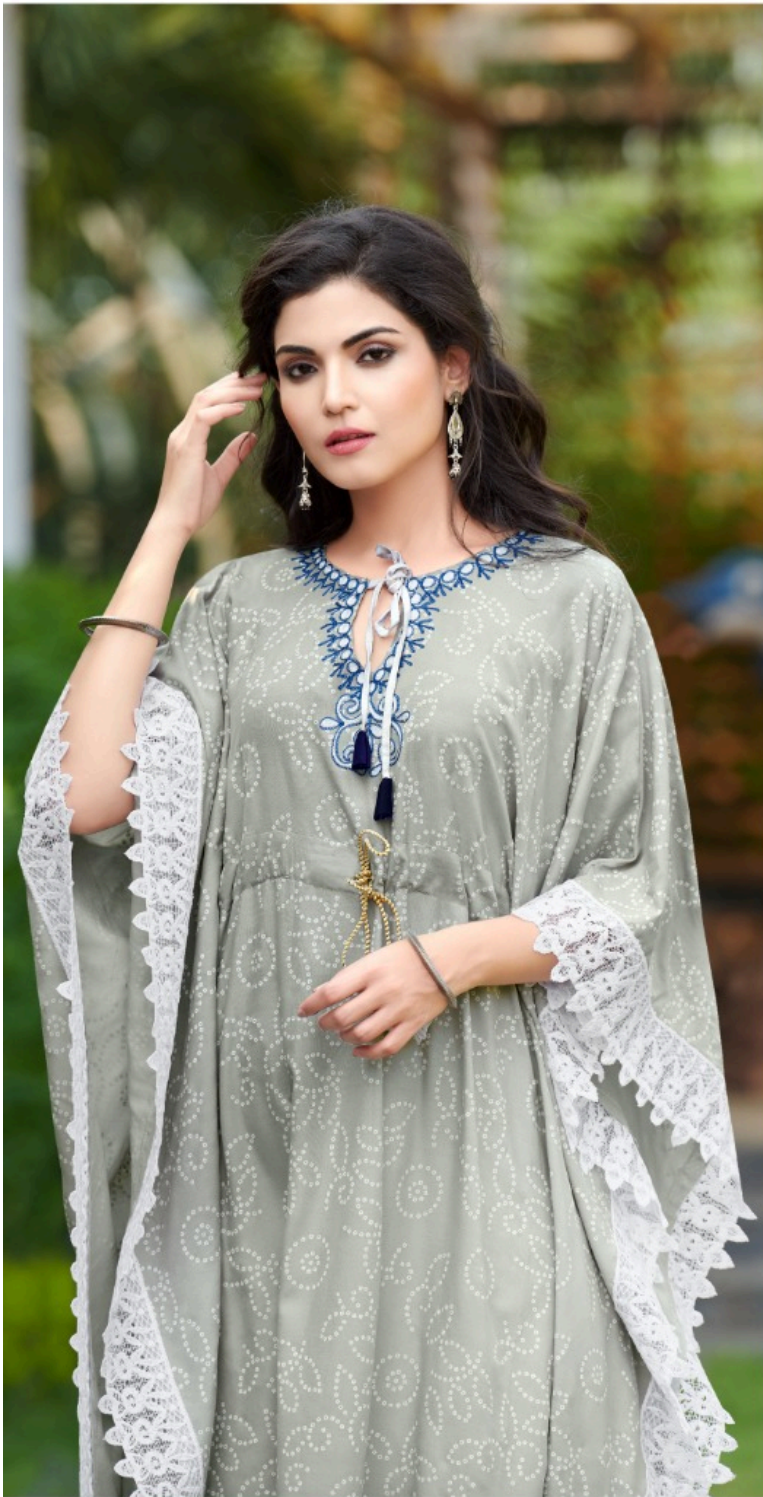
Style - 202

THERE'S NO WAY YOU WON'T SLAY THIS FASTIVE SEASON ADORNED IN THIS LAYERED BEAUTY.