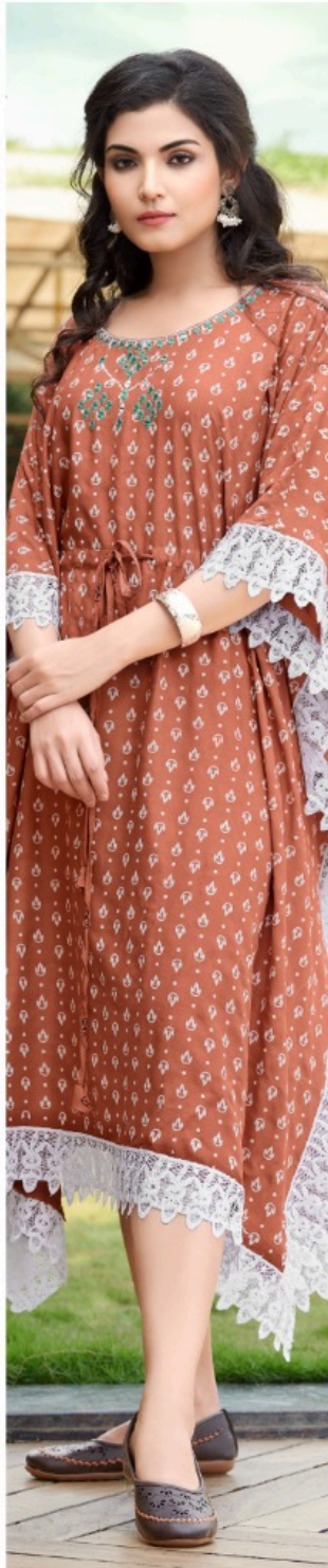
Style - 201