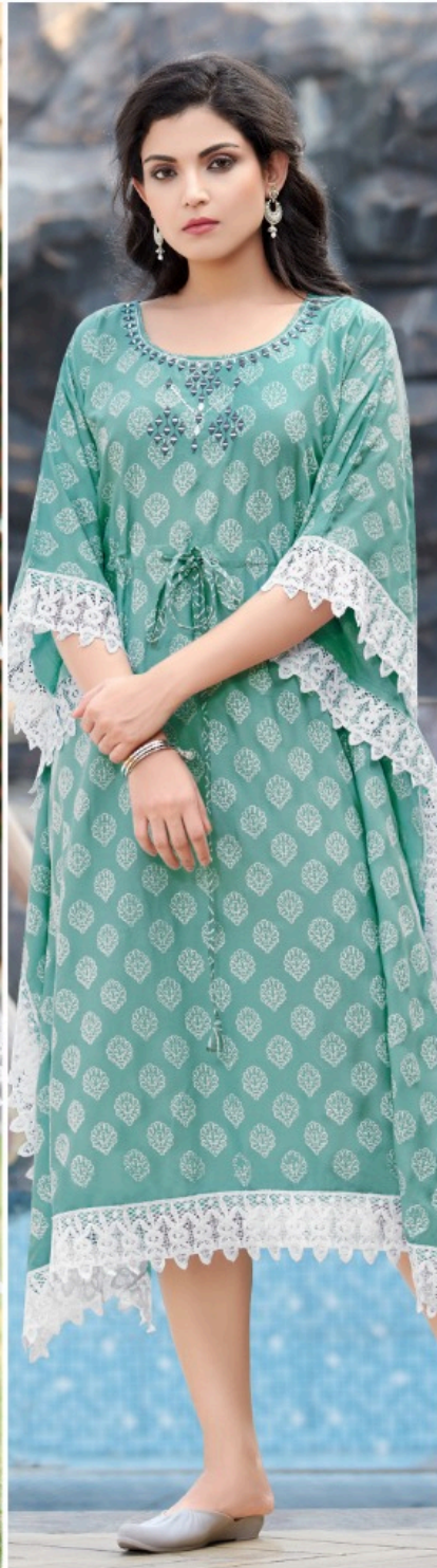
Style - 206