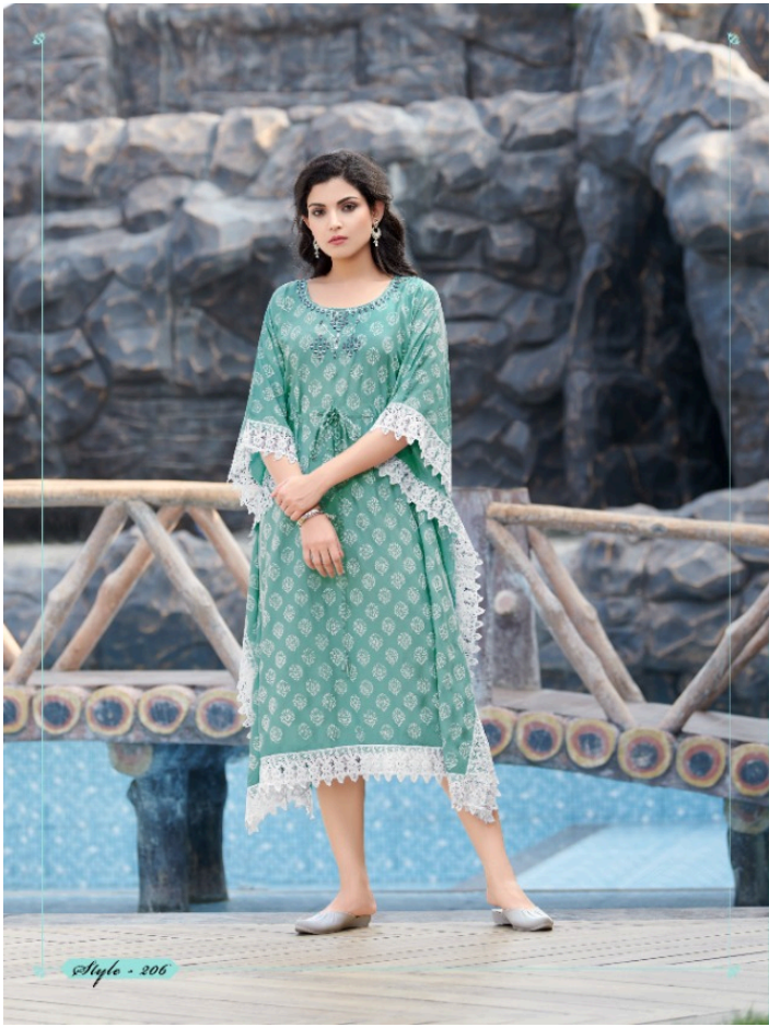
Style - 206