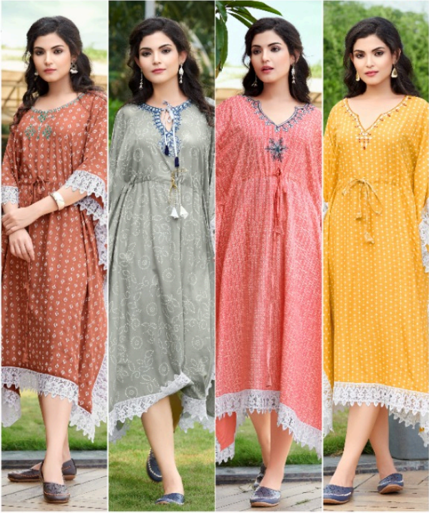
Style - 201