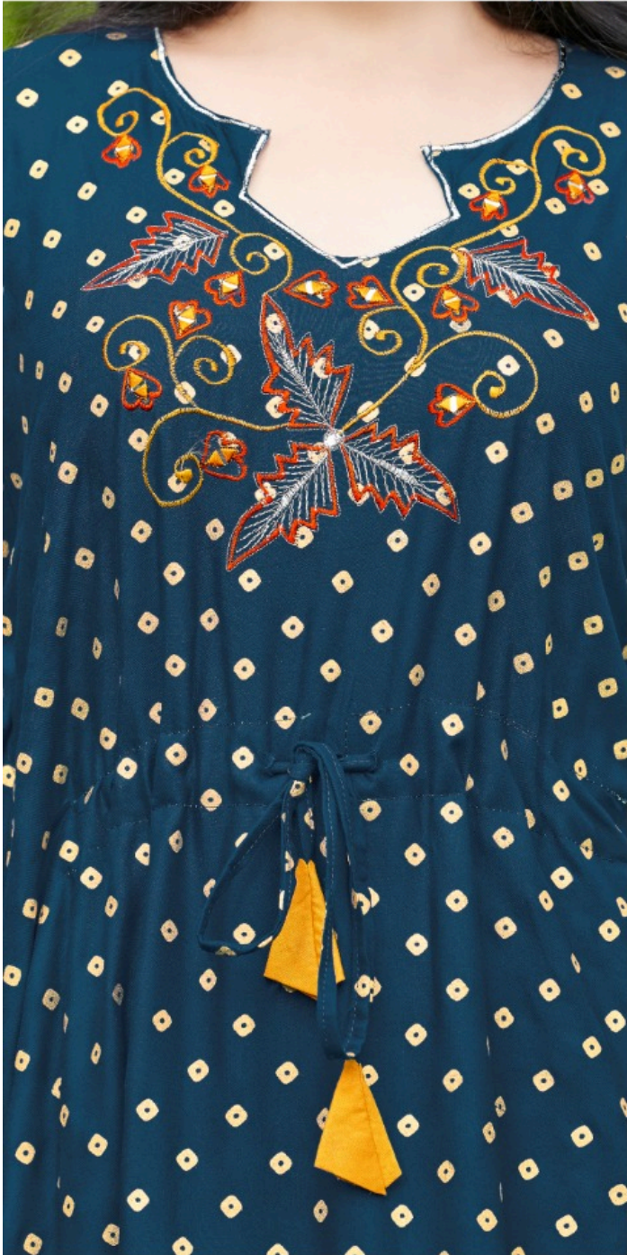
Style - 207