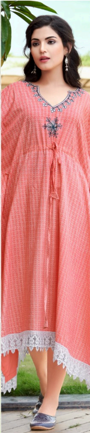
Style - 203