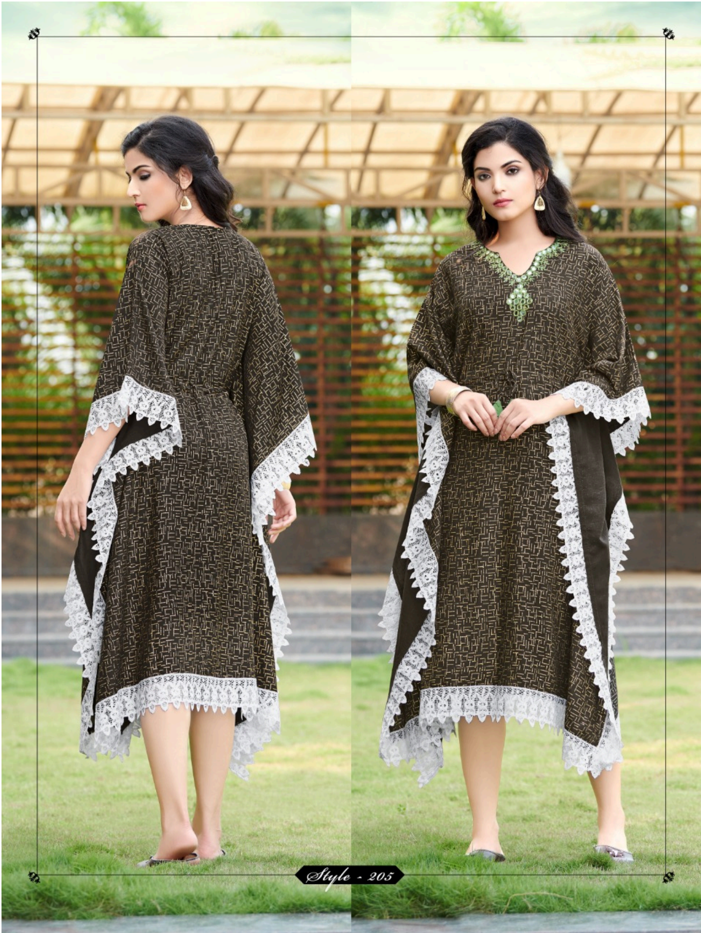
Style - 205