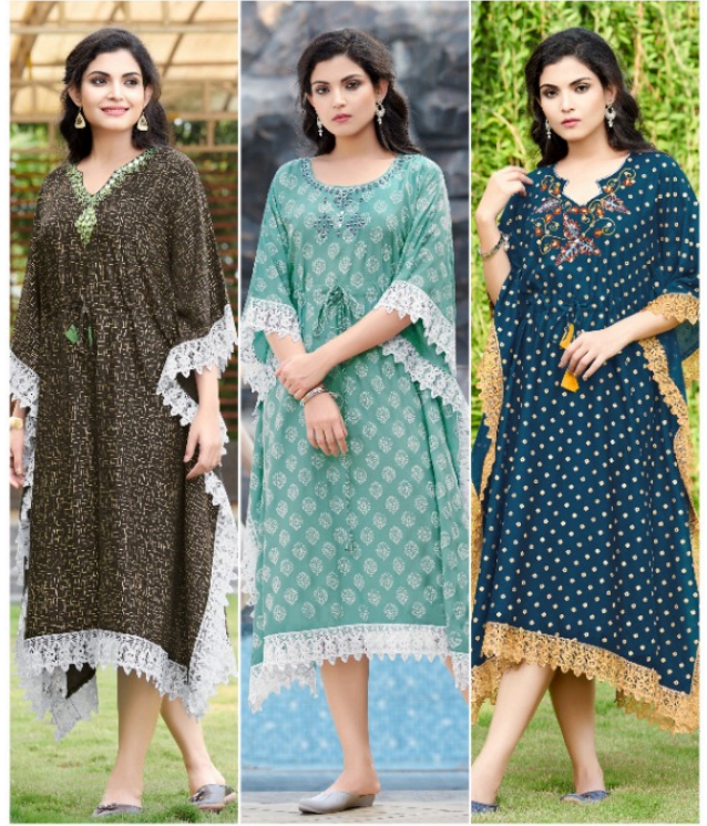
Style - 205