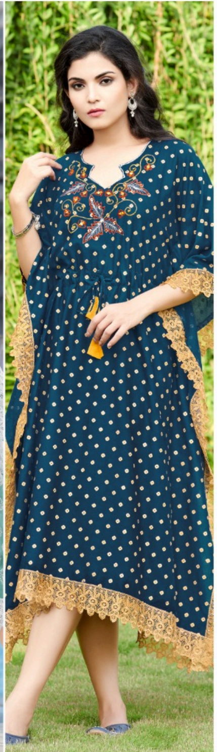
Style - 207