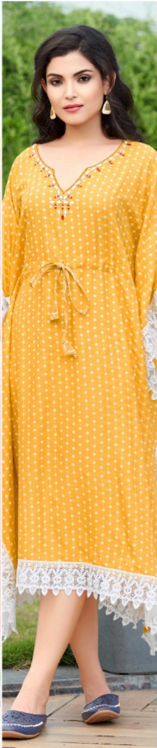
Style - 204