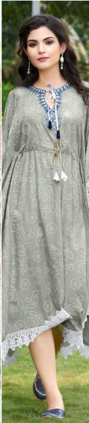
Style - 202