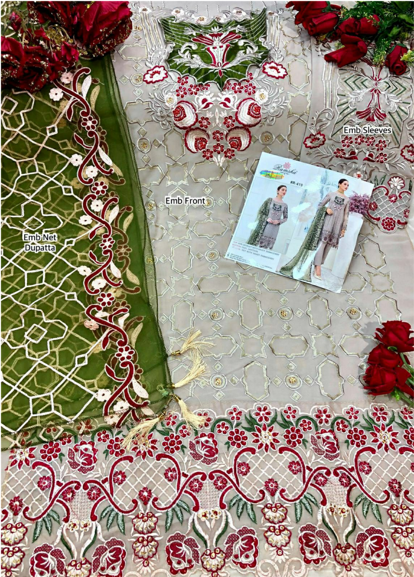
Emb Net Dupatta