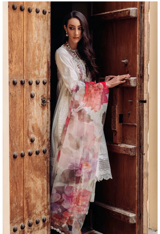
BEAUTY & THE BEAST I love fashion and that's how I express myself