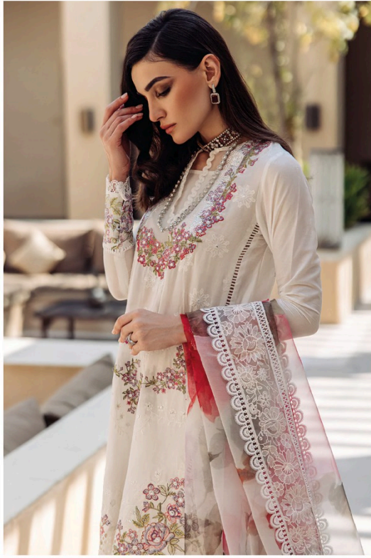
BEAUTY & THE BEAST I love fabrics and that's how I express myself