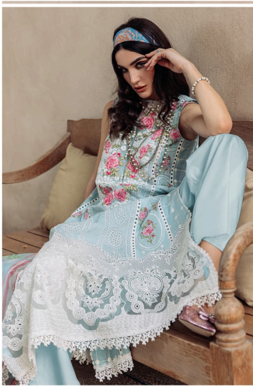
TIME TO shine I love fashion and that's how I express myself