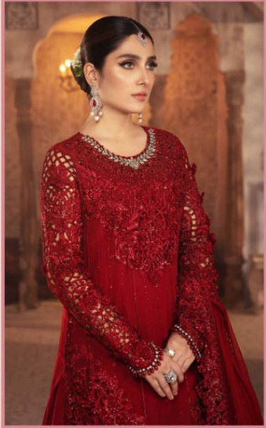
EMBROIDERED MARIYA.B. VOL-15