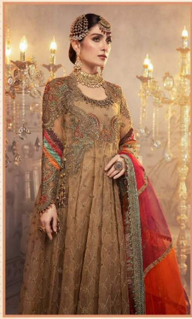
EMBROIDERED MARIYA.B. Vol-15