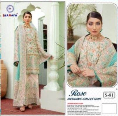
Rose WEDDING COLLECTION S-81