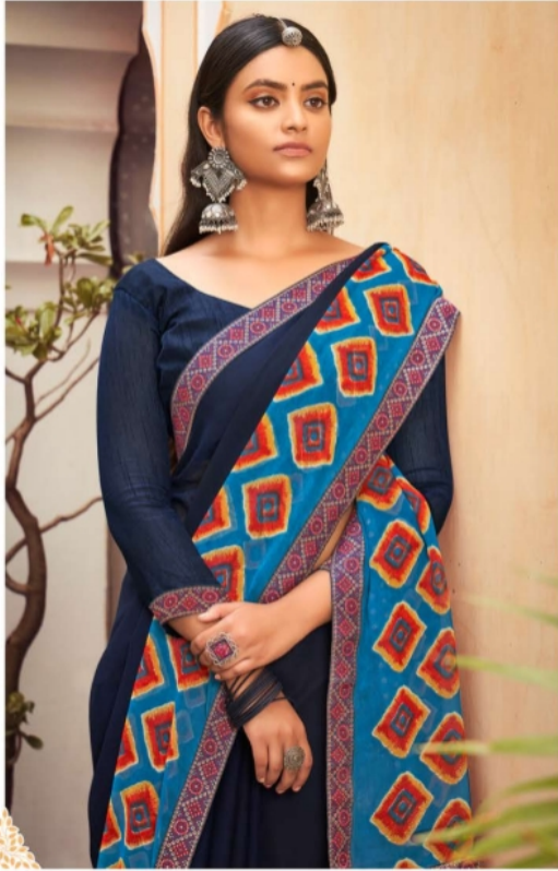
MAGNIFICENT LOOK Be beautiful with the magnetic look, design and colorful collection.