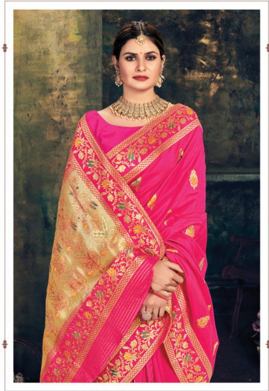
WELCOME THE CHANGE OF SEASON WITH THIS FABULOUSLY TRENDY SAREE.