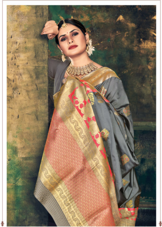
REVEAL YOUR STYLE WITH THIS HIGHLY ADORNED SAREE CREATED FOR THAT SPECIAL SUMMER OCCASION