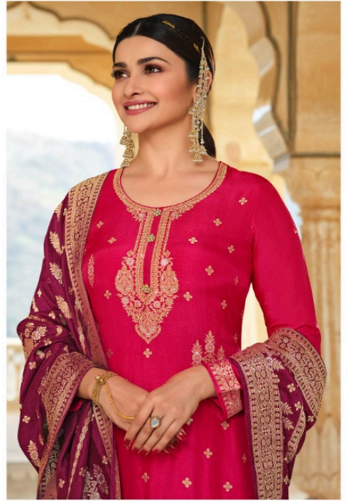
The royal "Finely intertwined threads and spectacular colour combination: Truly Royal."