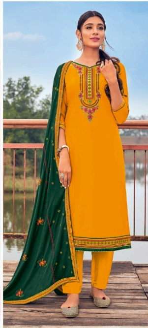
3 4 9 2