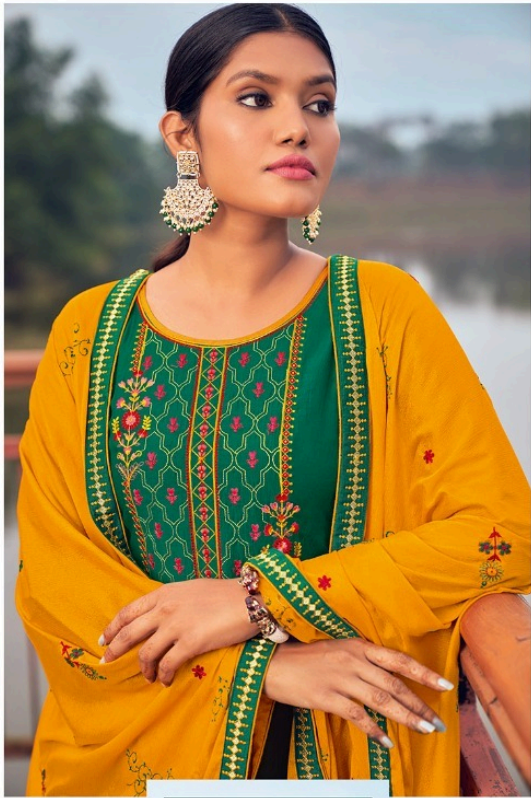
TIMELESS ELEGANCE code 3 4 9 4