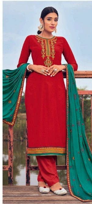
3 4 9 3