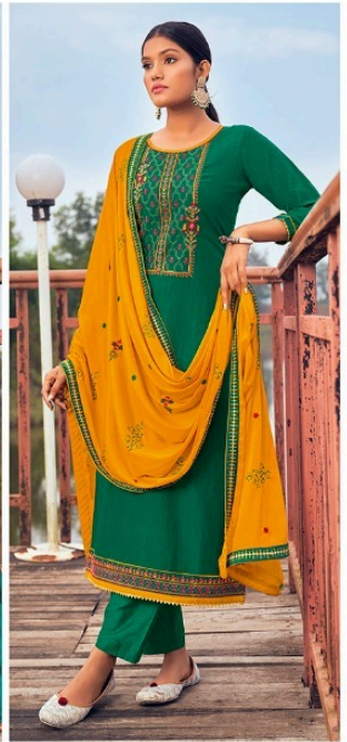
3 4 9 4