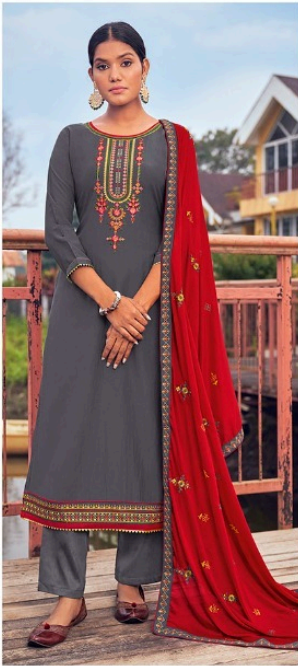
3 4 9 1