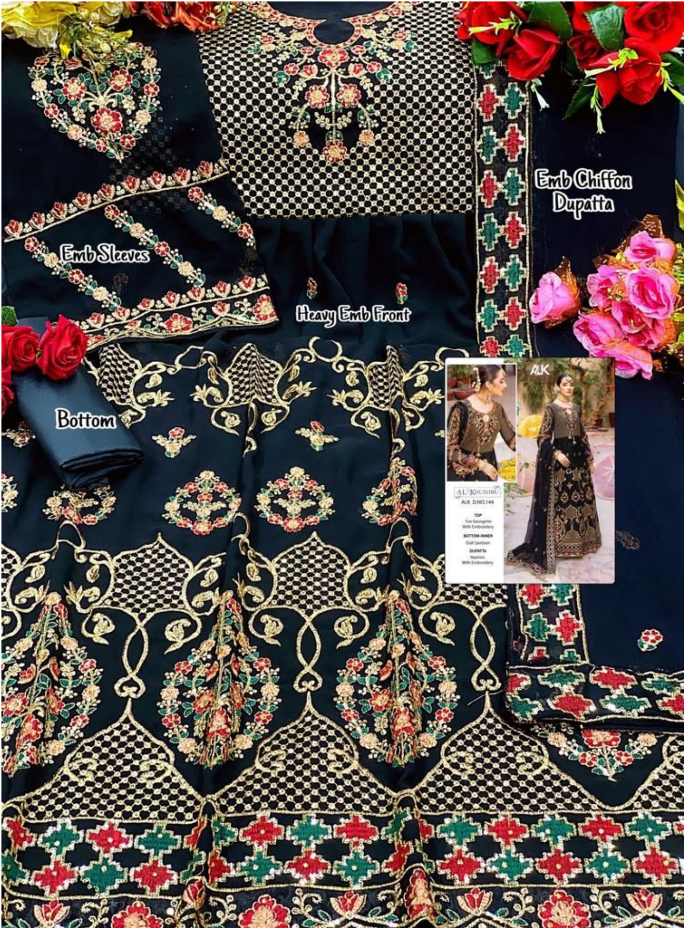
Emb Chiffon Dupatta