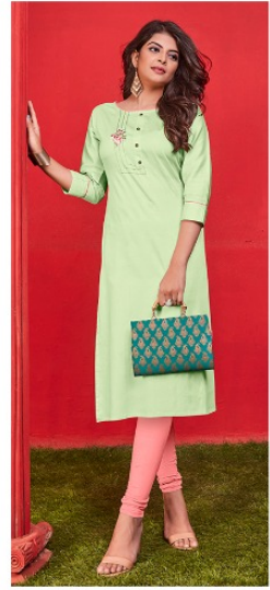
..... 54 .....