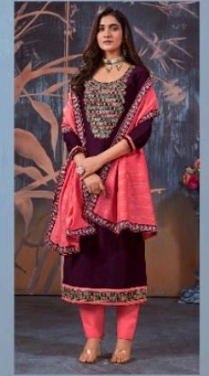
D. NO. 11735