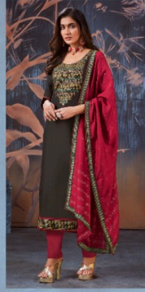
D. NO. 11731