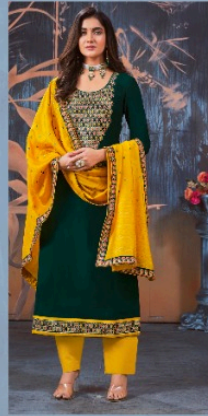
D. NO. 11734