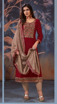
D. NO. 11733