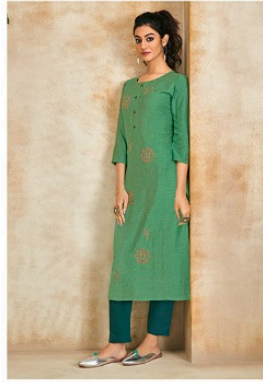
CODE | 3242