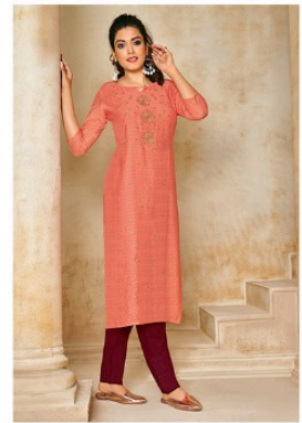
CODE | 3248