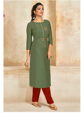
CODE | 3246