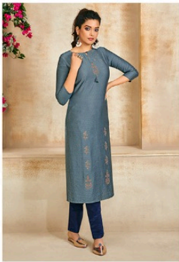
CODE | 3243