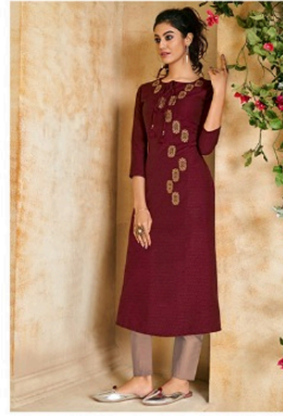
CODE | 3245