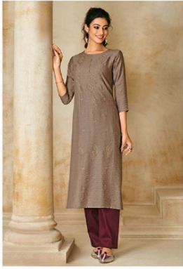
CODE | 3241