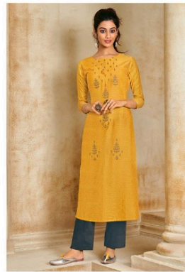
CODE | 3247