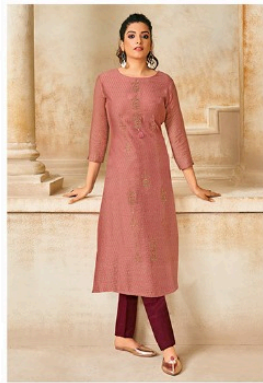
CODE | 3244