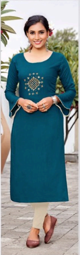
... D.NO. 1001 ...