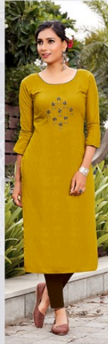
... D.NO. 1003 ...