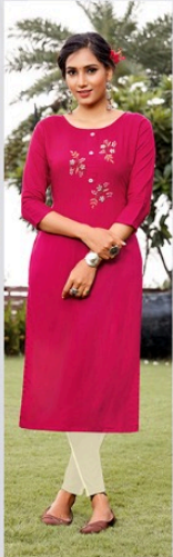
... D.NO. 1002 ...