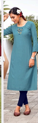
... D.NO. 1008 ...