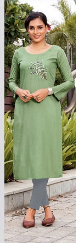
... D.NO. 1004 ...