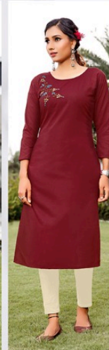
... D.NO. 1007 ...