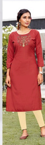
... D.NO. 1005 ...