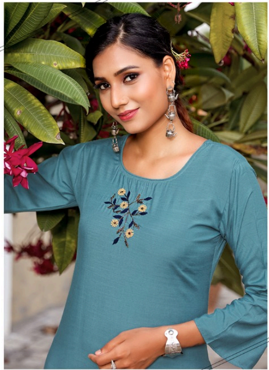
... D.NO. 1008 ...