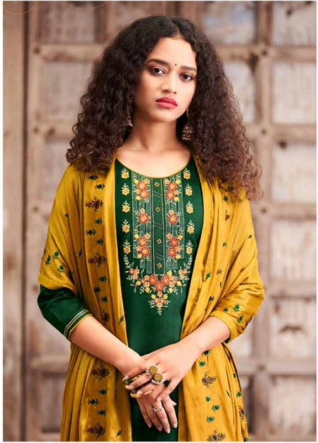
Simple without letting go of elegance & tradition with natural fabrics • 13033 •