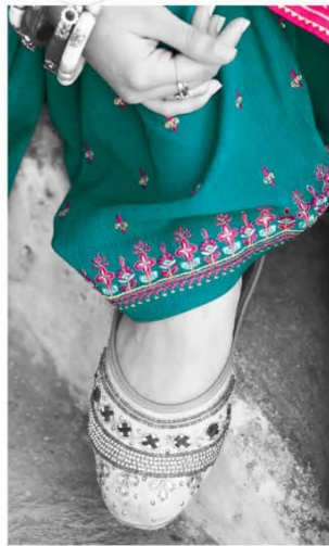
Brilliant hues & lustrous textures give you a new makeover this season