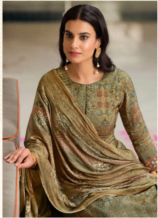
Fashion has to reflect who are you are