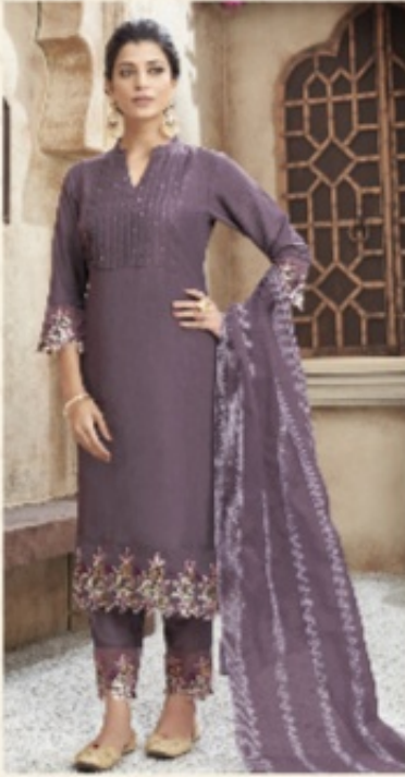
SHAK - 61