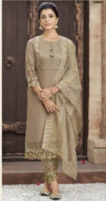
SHAK - 65