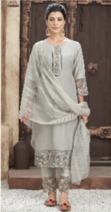
SHAK - 64