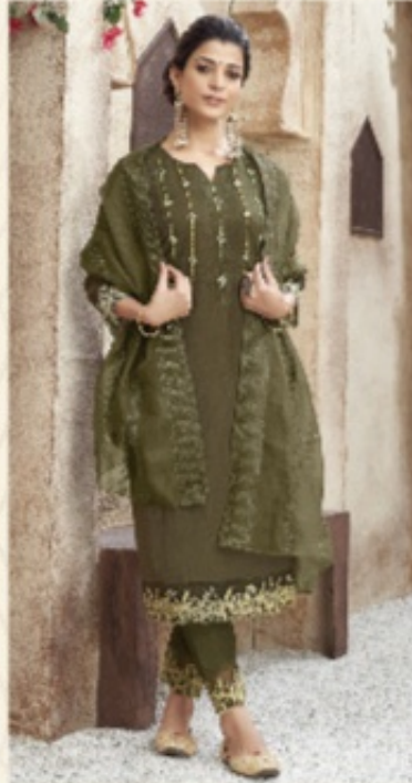
SHAK - 66