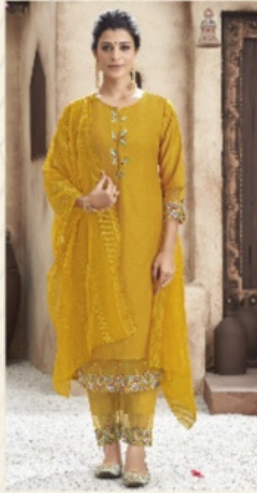
SHAK - 63