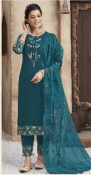
SHAK - 62