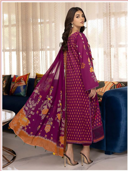
AYESHA ZARA PREMIUM COLLECTION VOL-8