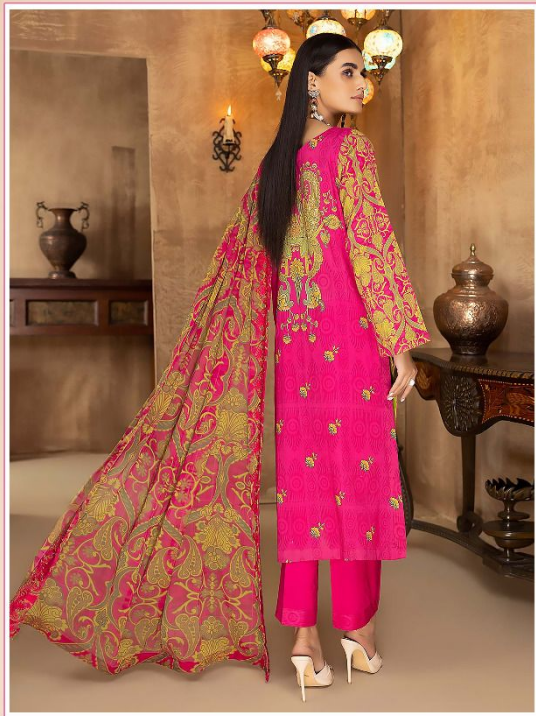
AYESHA ZARA PREMIUM COLLECTION VOL-8