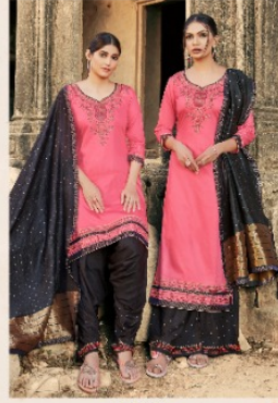
D.No :- 5755