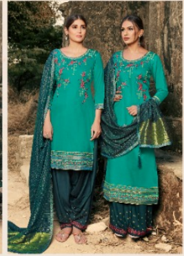
D.No :- 5758