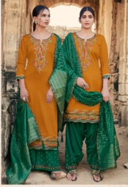
D.No :- 5751