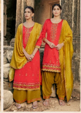
D.No :- 5756