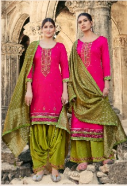
D.No :- 5753