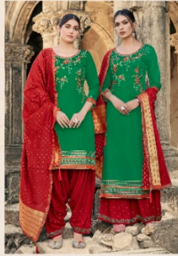
D.No :- 5754