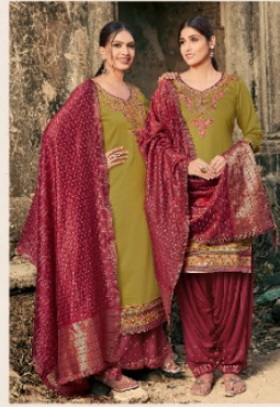
D.No :- 5757