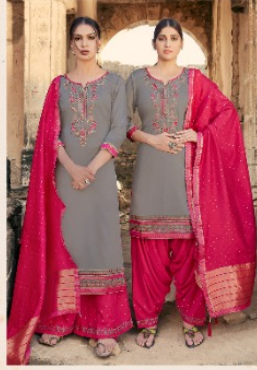
D.No :- 5752