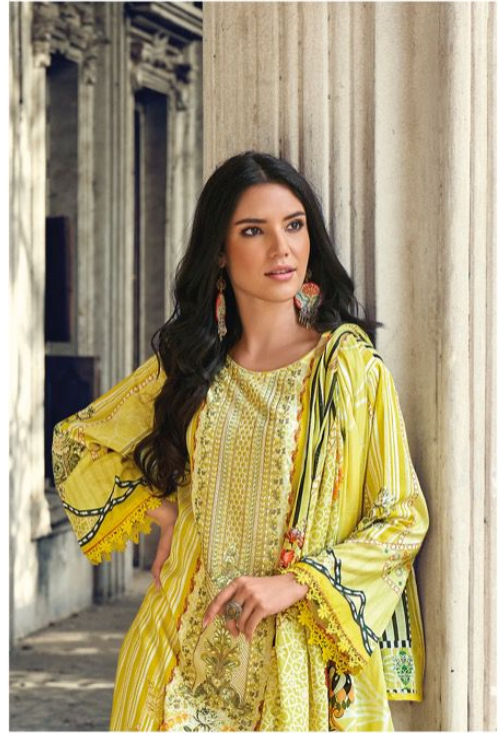
A black vermillion spans gold and beige, mughal miniature inspired printed dress, paired a silver chiffon dupatta in cream, vermillion and spans gold