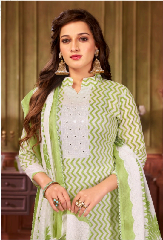
TOP :- PURE COTTON PRINT WITH KHATLI HAND WORK BOTTOM :- PURE COTTON SOLID DYED DUPATTA :- PURE COTTON KOTA CHEX PRINT