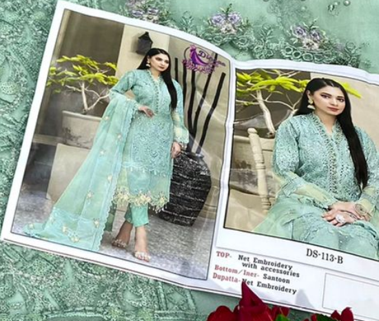
DS-113-B TOP: Net Embroidery with accessories Bottom/Inner: Sansara Dupatta: Net Embroidery