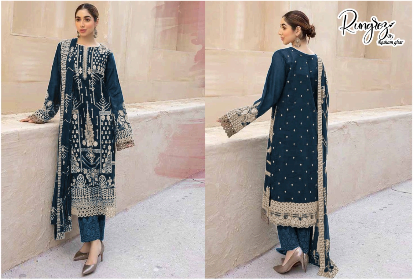
TOP : HEAVY EMBROIDERY WITH STONE WORK BOTTOM : SANTOON WITH EMBROIDERY PATCH DUPATTA : HEAVY EMBROIDERY WORK WITH LACE WORK