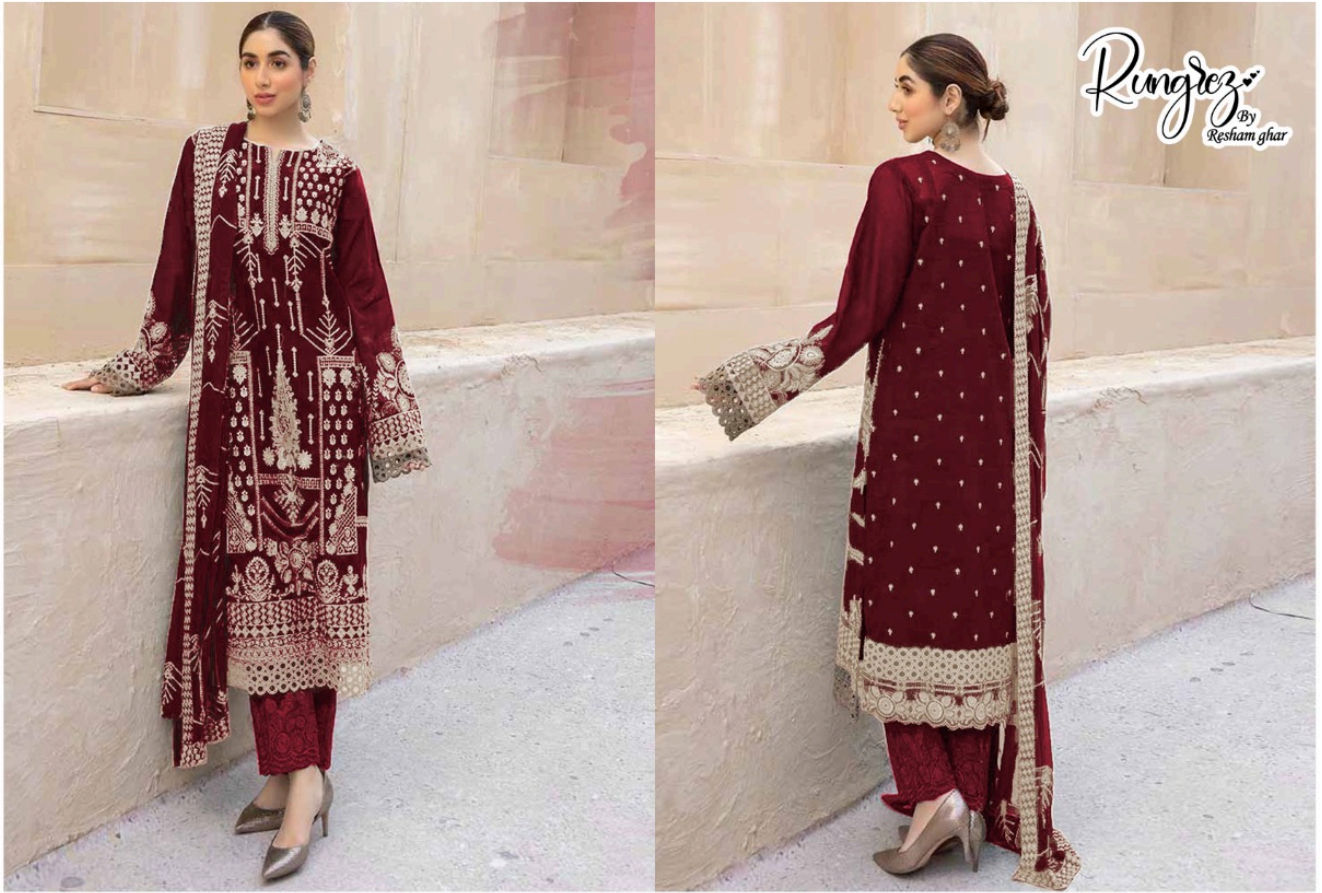
TOP : HEAVY EMBROIDERY WITH STONE WORK BOTTOM : SANTOON WITH EMBROIDERY PATCH DUPATTA : HEAVY EMBROIDERY WORK WITH LACE WORK