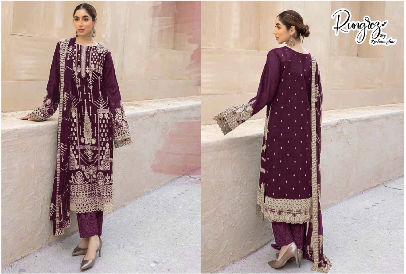
TOP : HEAVY EMBROIDERY WITH STONE WORK BOTTOM : SANTOON WITH EMBROIDERY PATCH DUPATTA : HEAVY EMBROIDERY WORK WITH LACE WORK