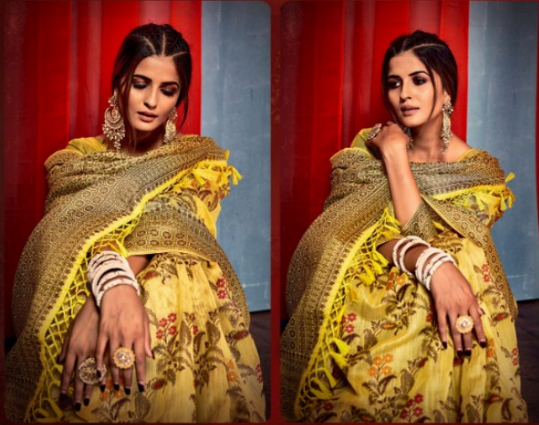
One of the elite designer-wears in rare bright color combination.