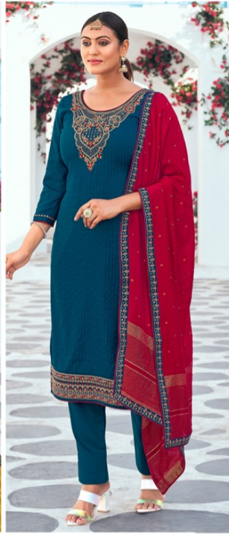
• 01033 •