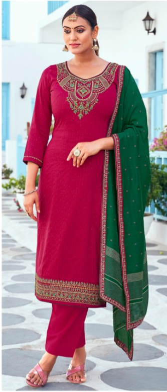
• 01031 •