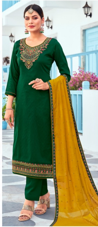
• 01032 •