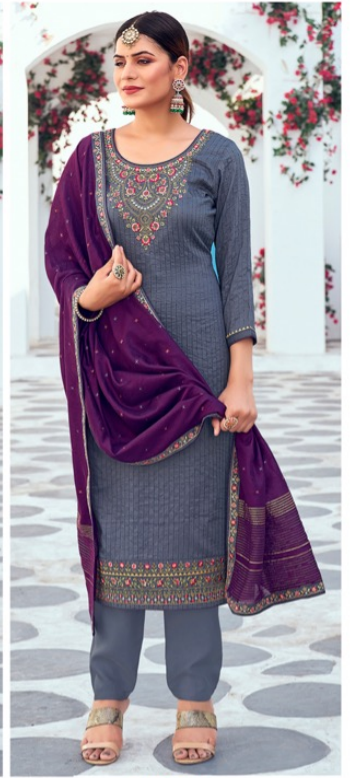
• 01034 •