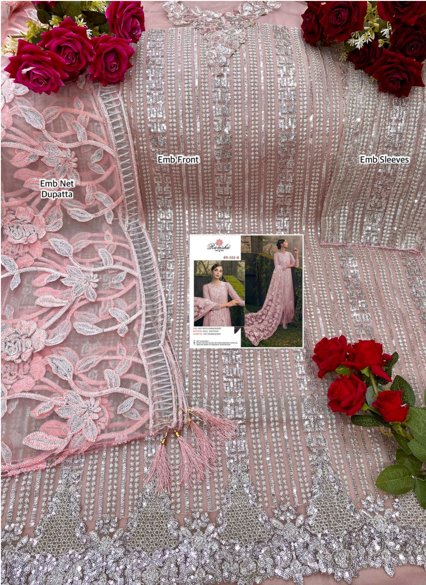
Emb Net Dupatta