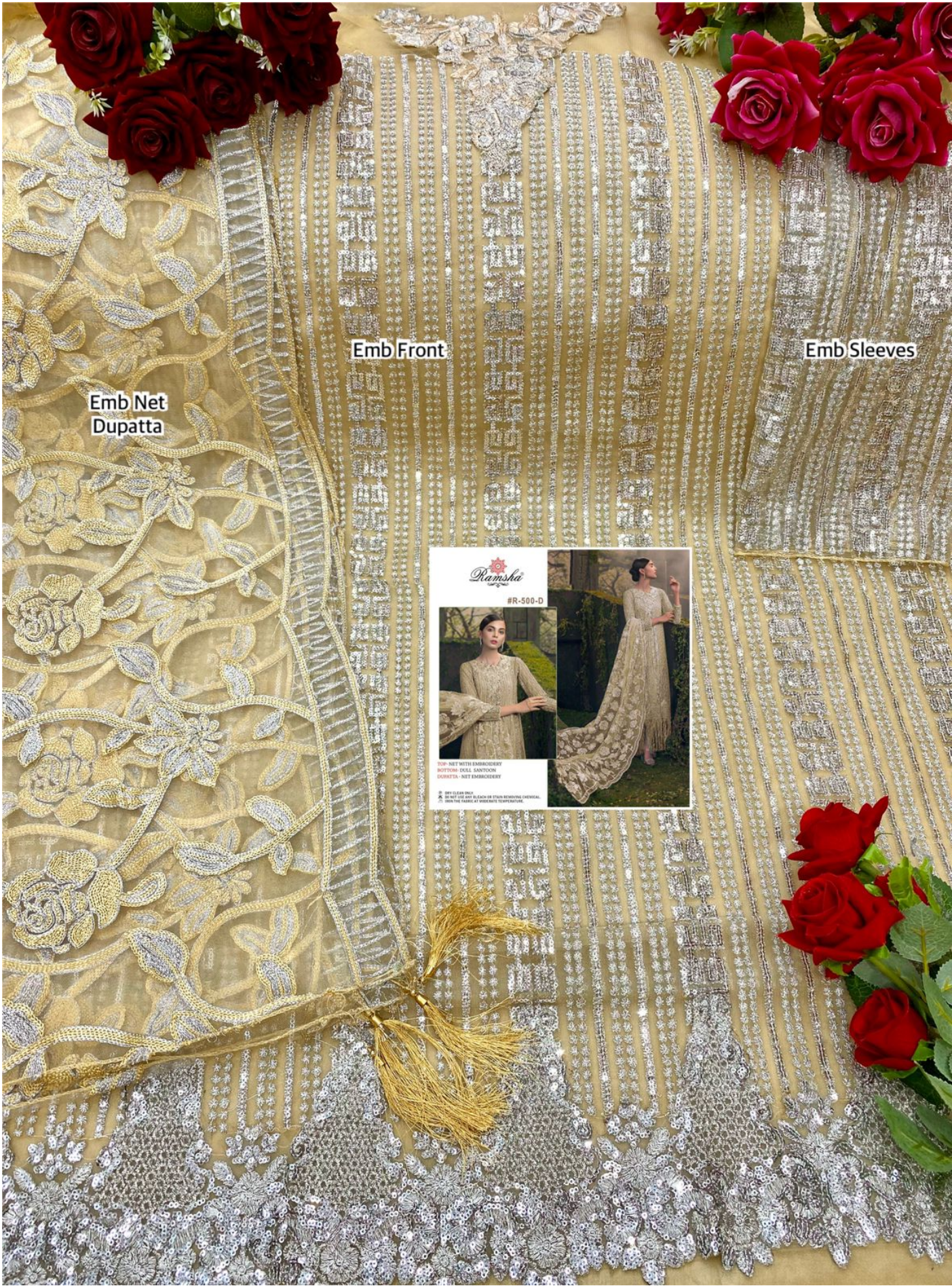
Emb Net Dupatta