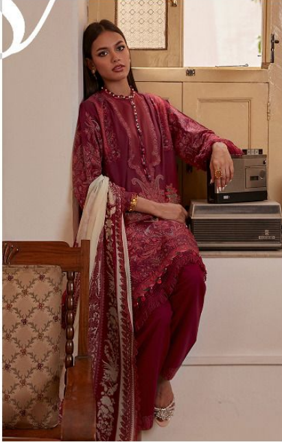
SANA SAFINAZ NX MUZLIN COLLECTION VOL-9