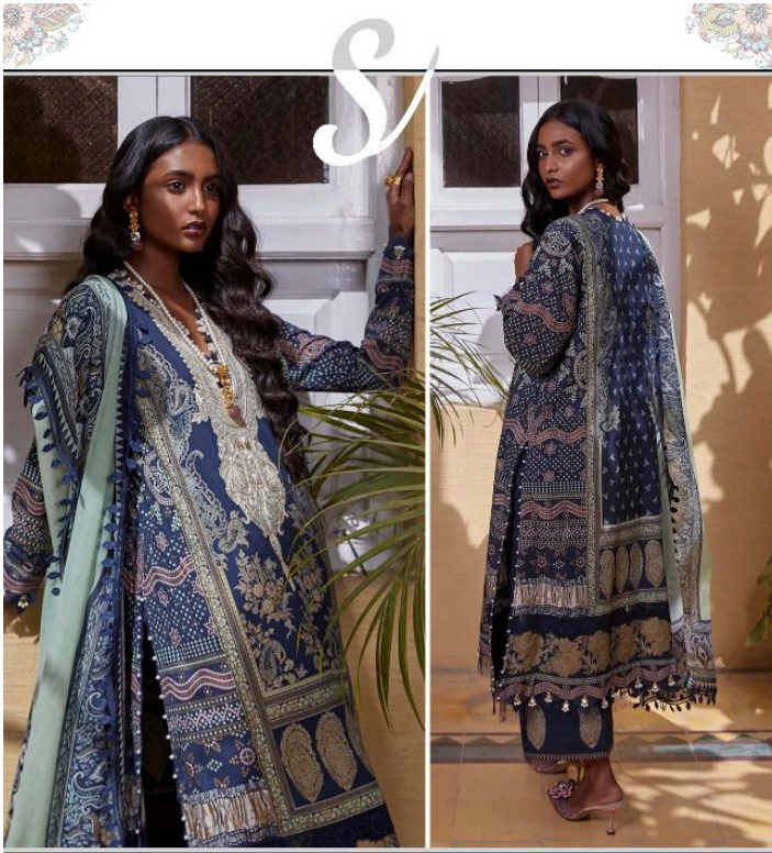
SANA SAFINAZ NX MUZLIN COLLECTION VOL-9