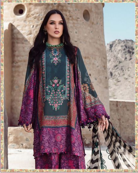
MARIYA.B Winter Collection VOL-4