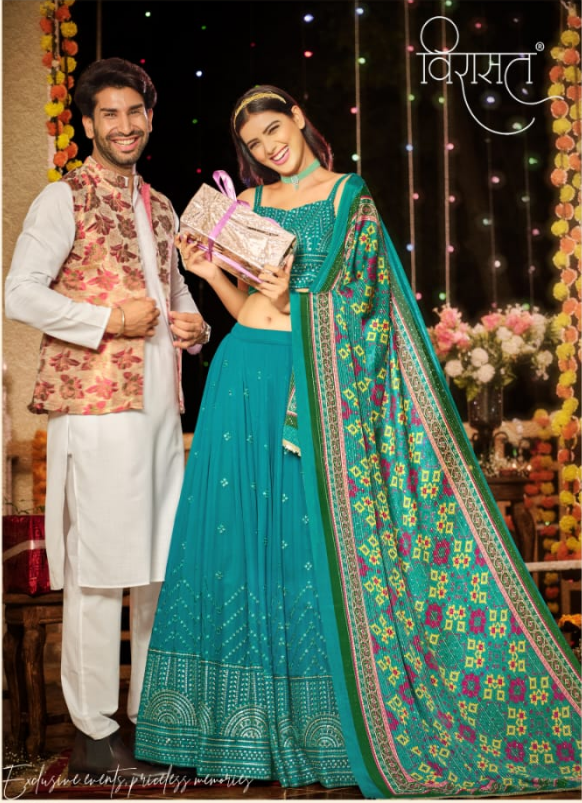
•• A bridal memoria _ 2002