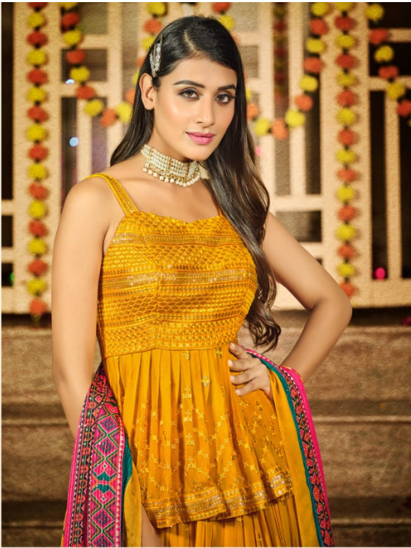
•• A bridal memoria _ 2001