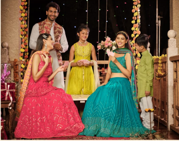
•• A bridal memoria _ 2003