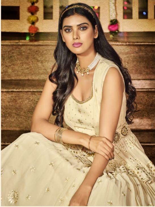
Lucky in love •• A bridal memoria _ 2004