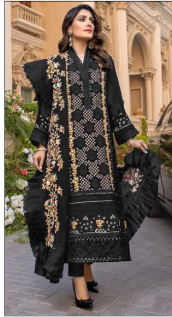
D.NO S- 58 D