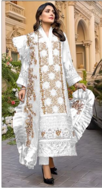
D.NO S- 58 B

TOP - FOX GEORGETTE WITH HEAVY EMBROIDERY DUPATTA - NAZNEEN WITH FRILL & EMBROIDERY WORK INNER / BOTTOM - SANTOON