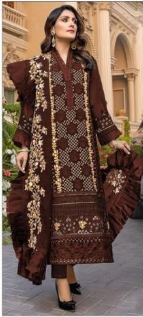
S- 58 M

TOP - FOX GEORGETTE WITH HEAVY EMBROIDERY DUPATTA - NAZNEEN WITH FRILL & EMBROIDERY WORK INNER / BOTTOM - SANTOON