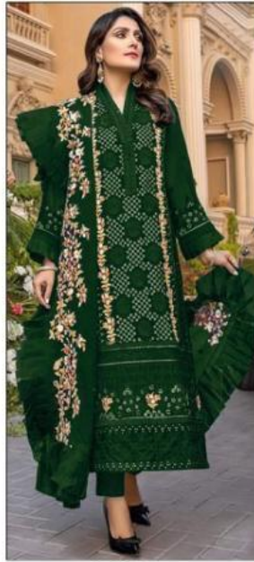
S- 58 O