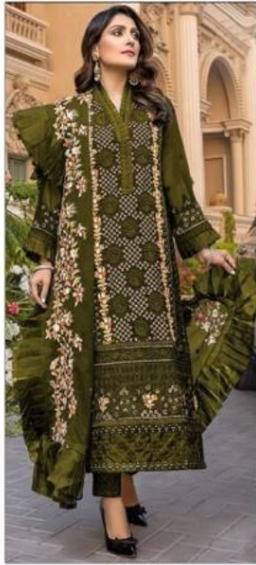
S- 58 N