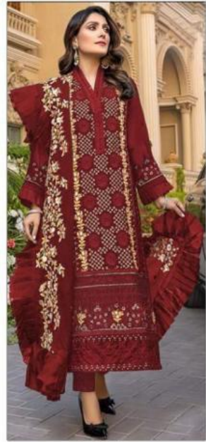
S- 58 P