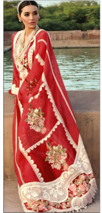
S - 85 H