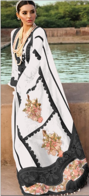
S - 85 E

Top - Lawn cotton heavy embroidered with neck emb patch Bottom - Semi lawn cotton Dupatta - Butterfly net heavy embroidered