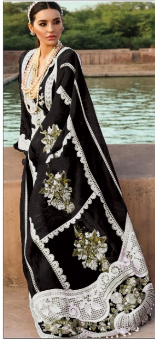
S - 85 G