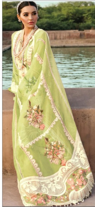
S - 85 F