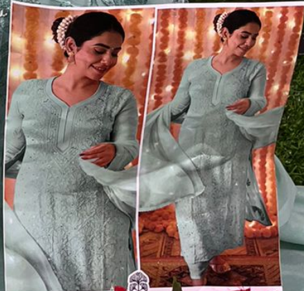
TOP For Georgetown with Embroidery D.N.C. D.P.