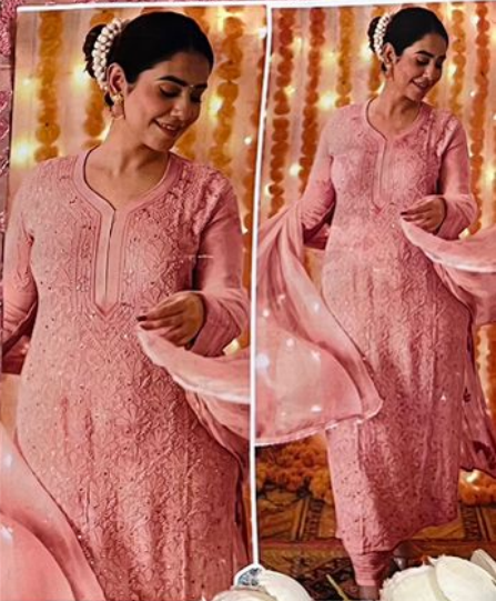
TOP Fox Georgette with Embroidery BOT