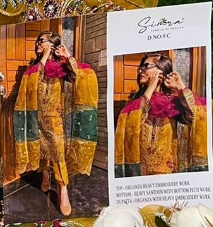
TOP - ORGANDA HEAVY EMBROIDERY WORK BOTTOM - HEAVY SANDOON WITH BOTTOM PECH WORK DUPUNTA - ORGANDA WITH HEAVY EMBROIDERY WORK