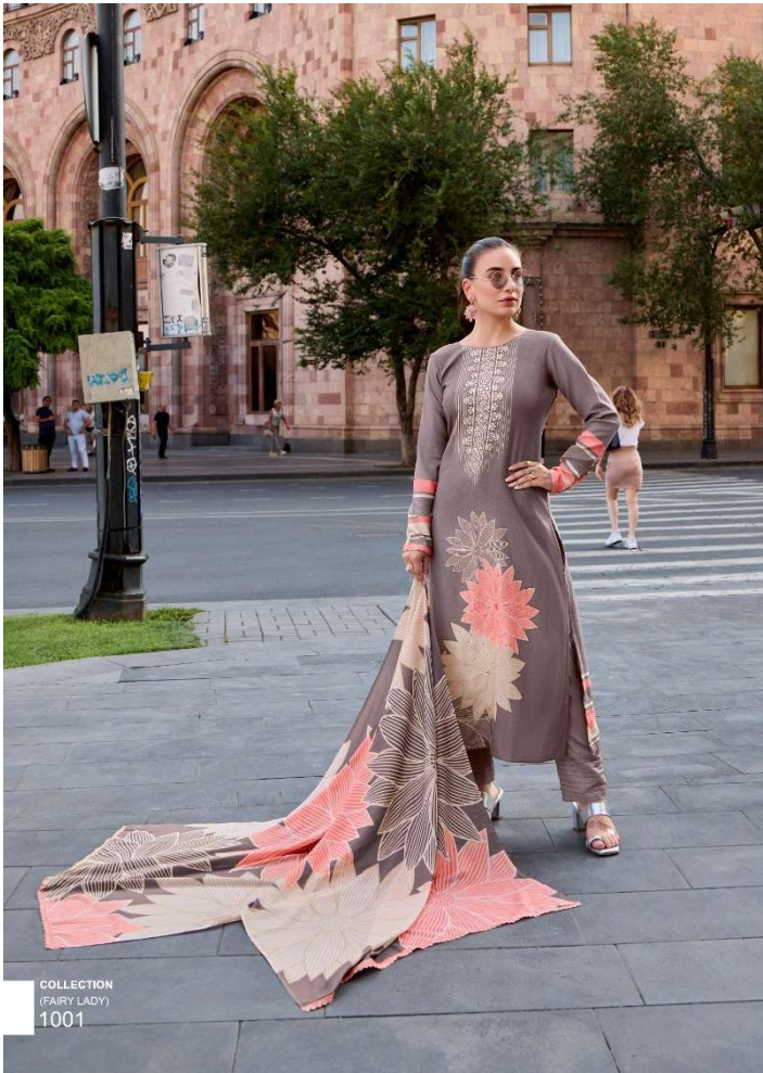
COLLECTION (FAIRY LADY) 1001