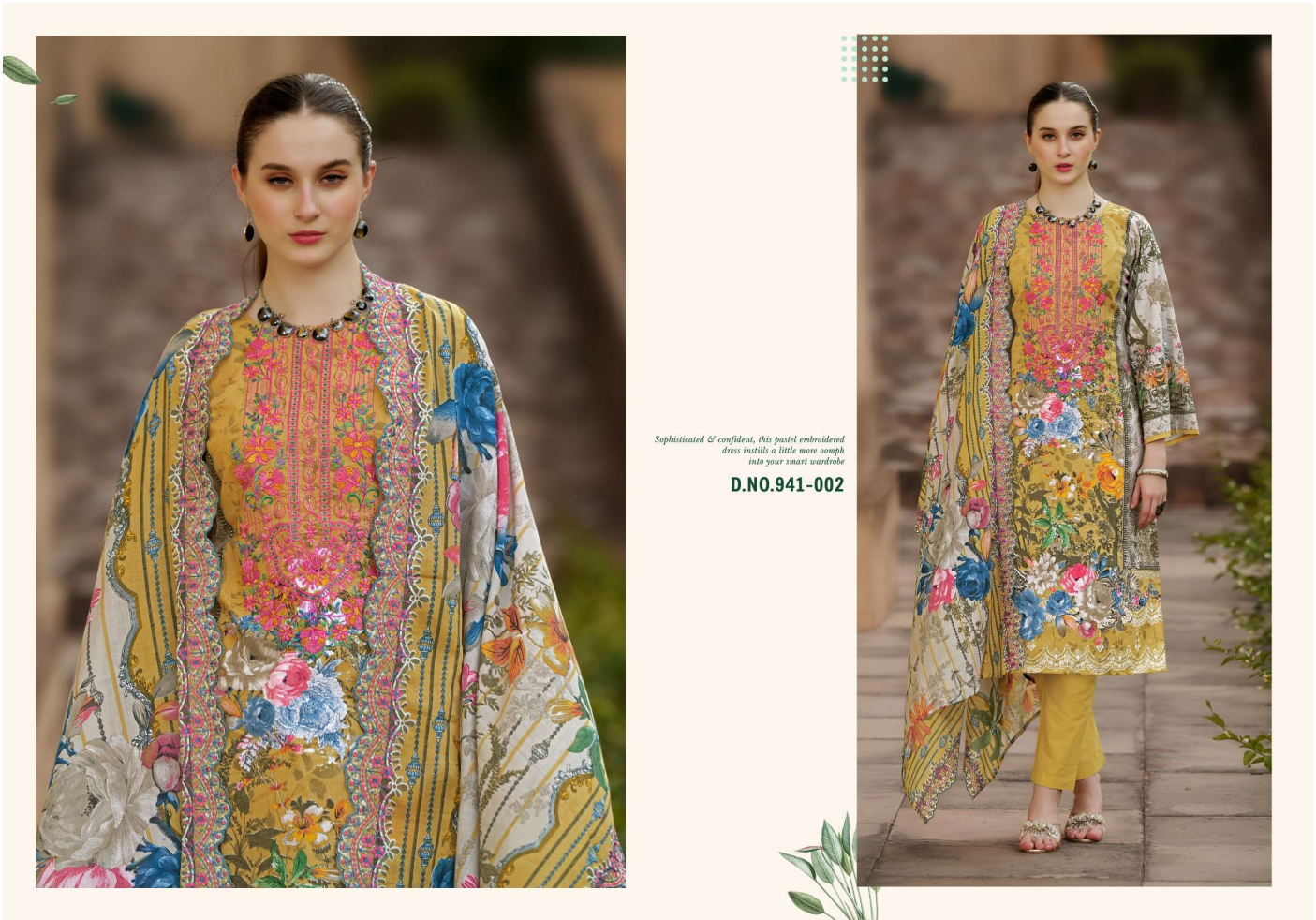
Sophisticated & confident, this pastel embroidered dress instills a little more oomph into your smart wardrobe D.NO.941-002