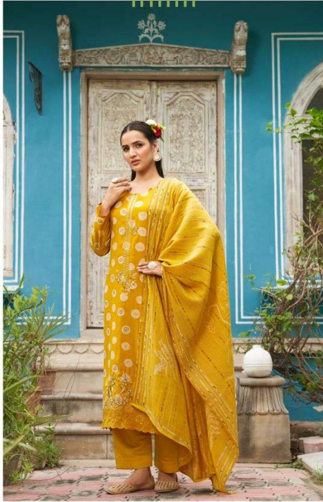
I dress myself, not to impress, but for comfort and for style.

ممتاز آرٹس MUMTAZ ARTS Playful & elegant