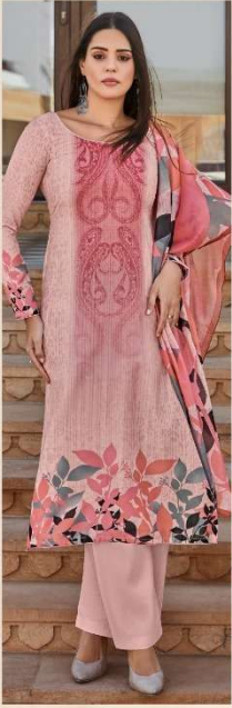
“ 1001 ”