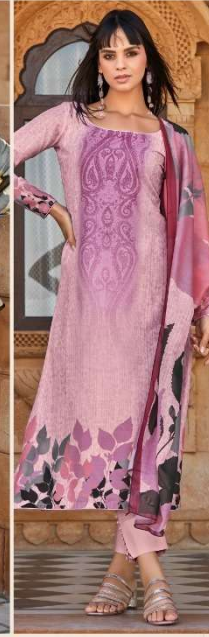
“ 1006 ”