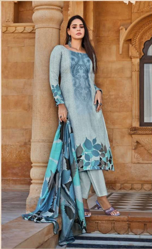
++ mirasī aram gardē Vintage chic, timeless allure