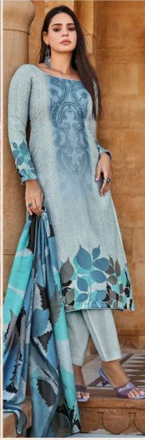
“ 1002 ”