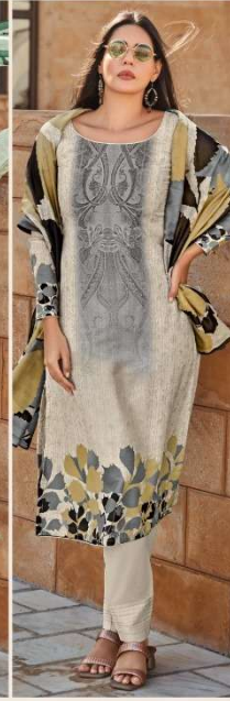
“ 1005 ”