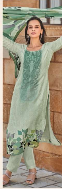
“ 1004 ”