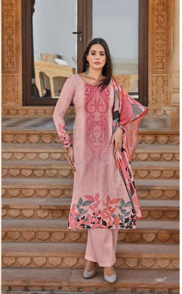
++ sleek minimalist look. Cutting-edge runway fashion.