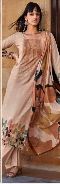
“ 1003 ”