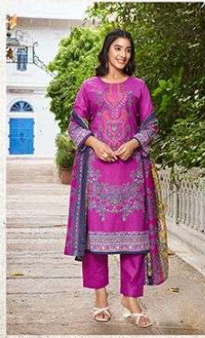
MUSAFIR - 3204