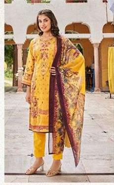
MUSAFIR - 3206