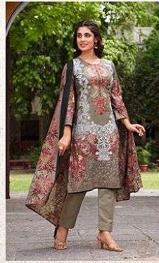
MUSAFIR - 3207