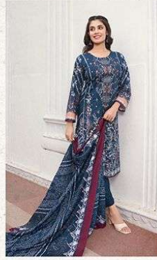
MUSAFIR - 3205