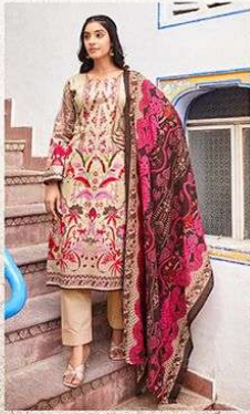
MUSAFIR - 3203