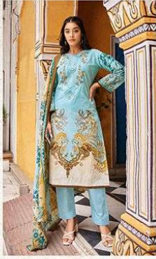
MUSAFIR - 3201