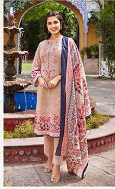
MUSAFIR - 3202