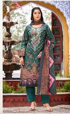
MUSAFIR - 3208