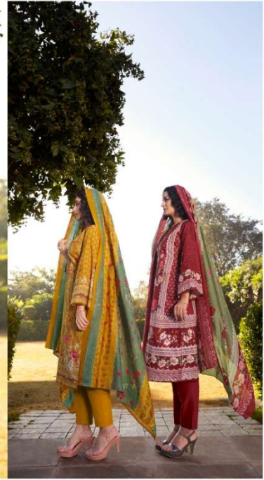
Remains a mystery