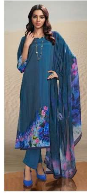
|| 1184 ||