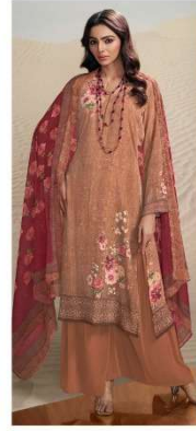
|| 1183 ||