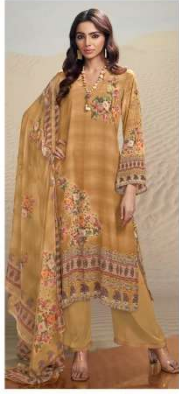
|| 1177 ||