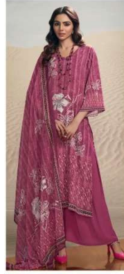
|| 1181 ||