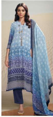
|| 1180 ||