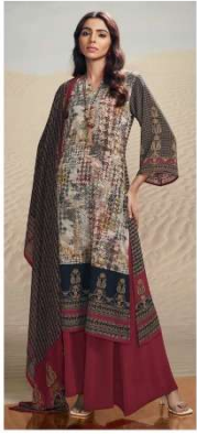
|| 1179 ||