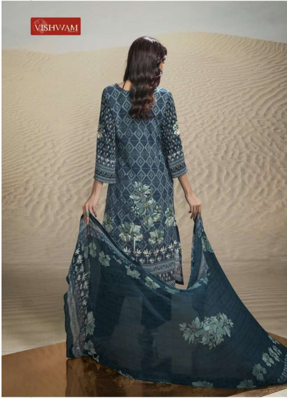
Crafted for the modern Maharani.