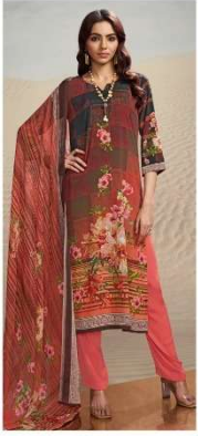
|| 1175 ||