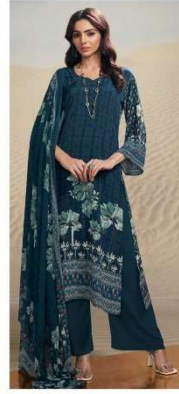
|| 1182 ||