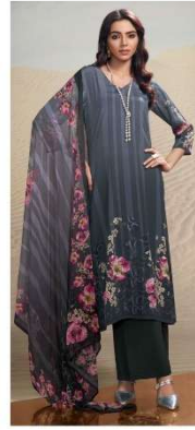
|| 1185 ||