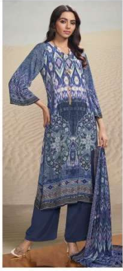
|| 1176 ||