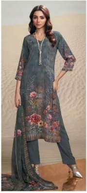
|| 1178 ||