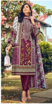
D.NO / 887-007