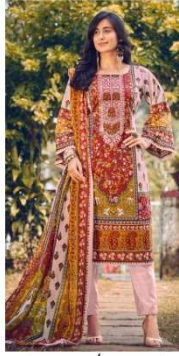
D.NO / 887-003