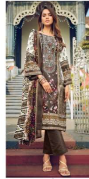
D.NO / 887-010