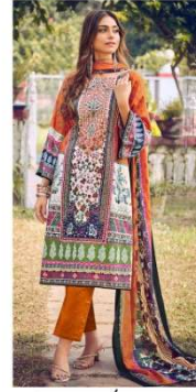
D.NO / 887-005