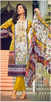
D.NO / 887-006