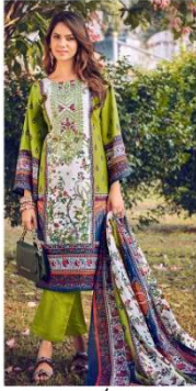
D.NO / 887-002