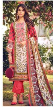
D.NO / 887-009