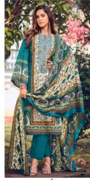
D.NO / 887-004