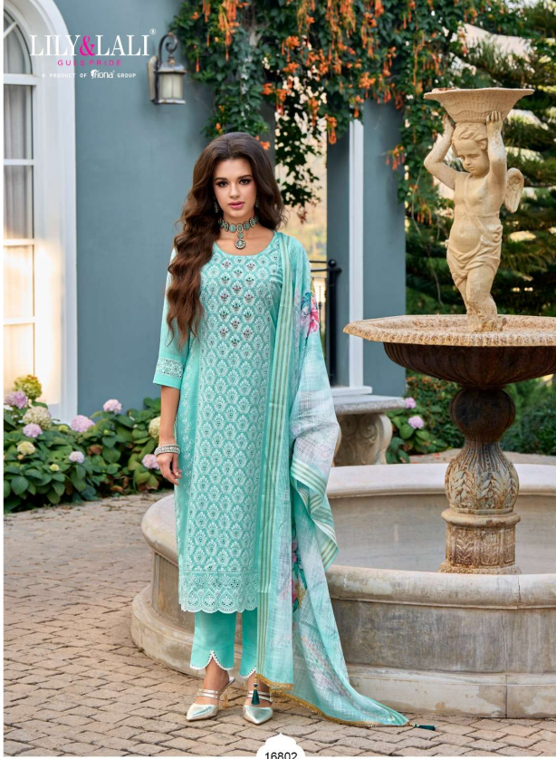
THE MODERN Enchantress