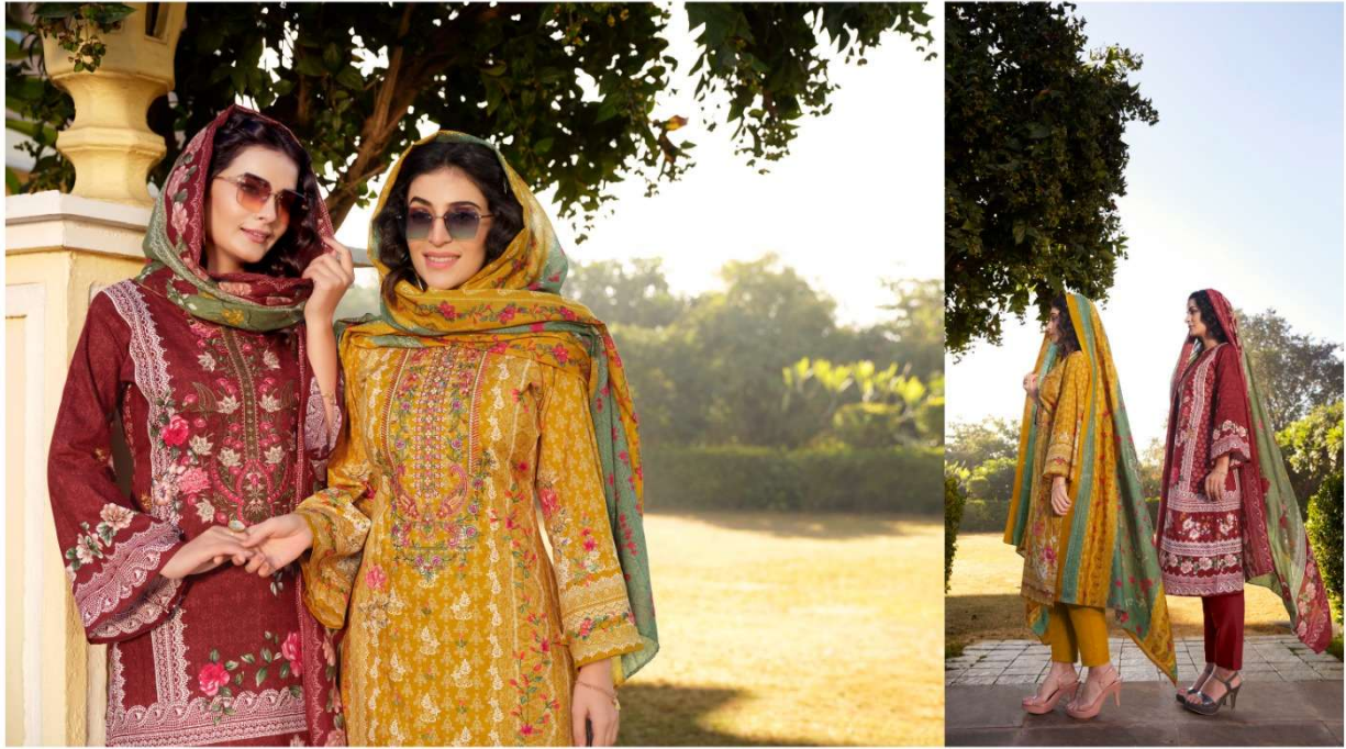
Remains a mystery