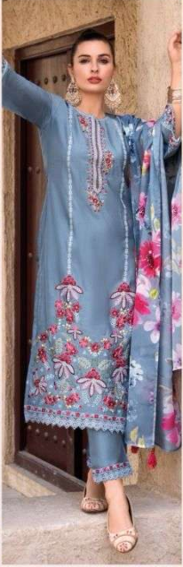
NOOREH // 1192