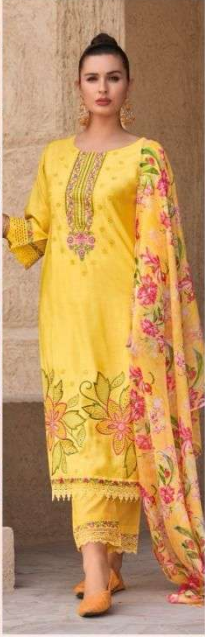
NOOREH // 1193