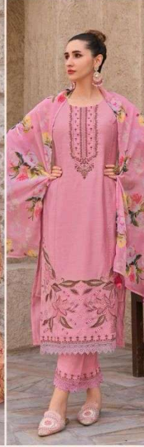
NOOREH // 1195