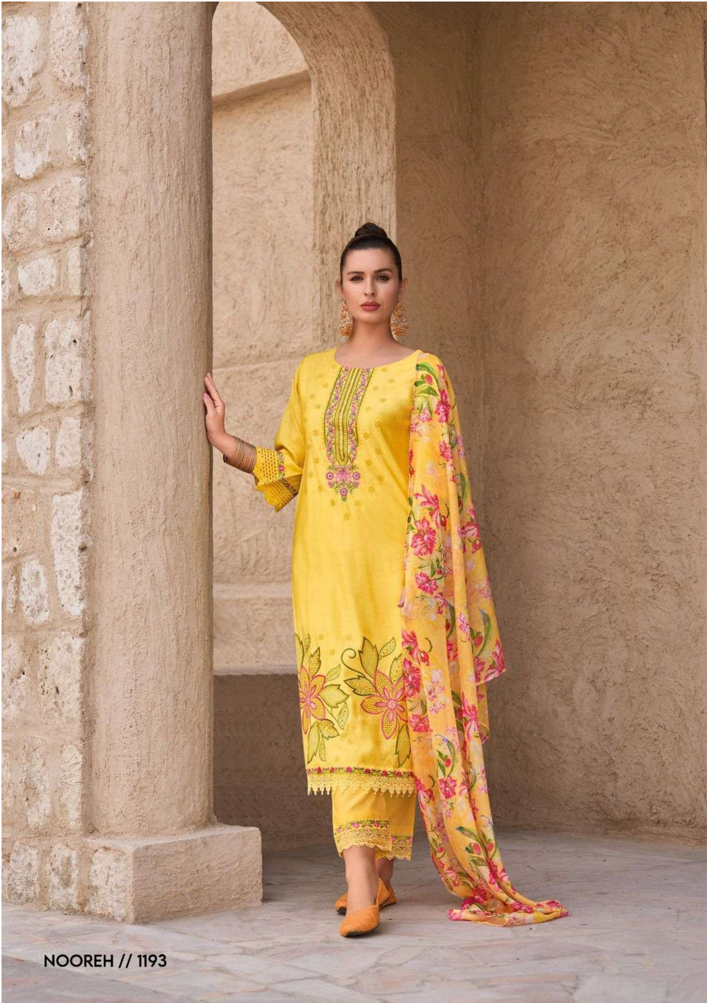
NOOREH // 1193