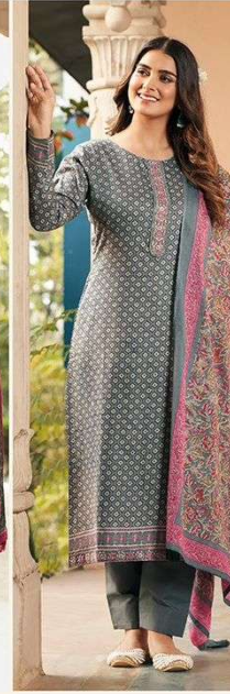
lcrh | -5005