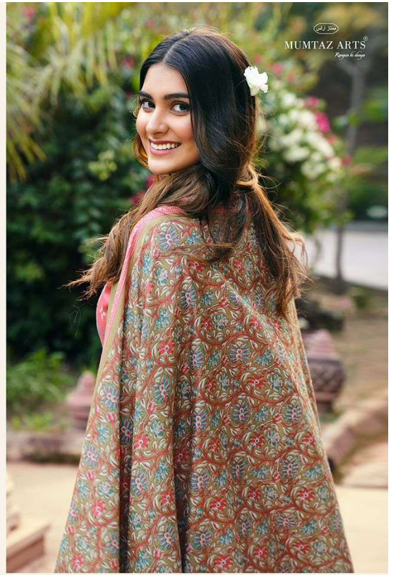
Itch | 5002