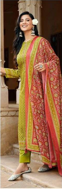
lcrh | -5001