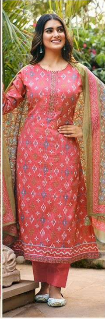
lcrh | -5002