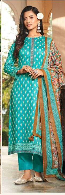
lcrh | -5003