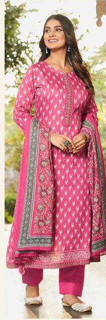
lcrh | -5004