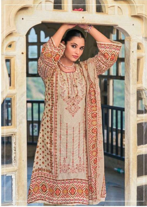
8002 WHEN A PERSON IS IN FASHION, ALL THEY DO IS RIGHT