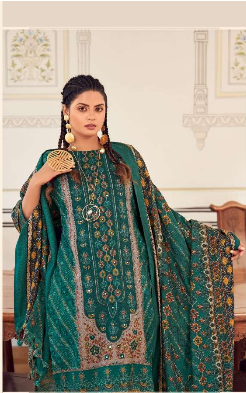
“ VINTAGE-INSPIRED LACE DRESS 855-003 ”